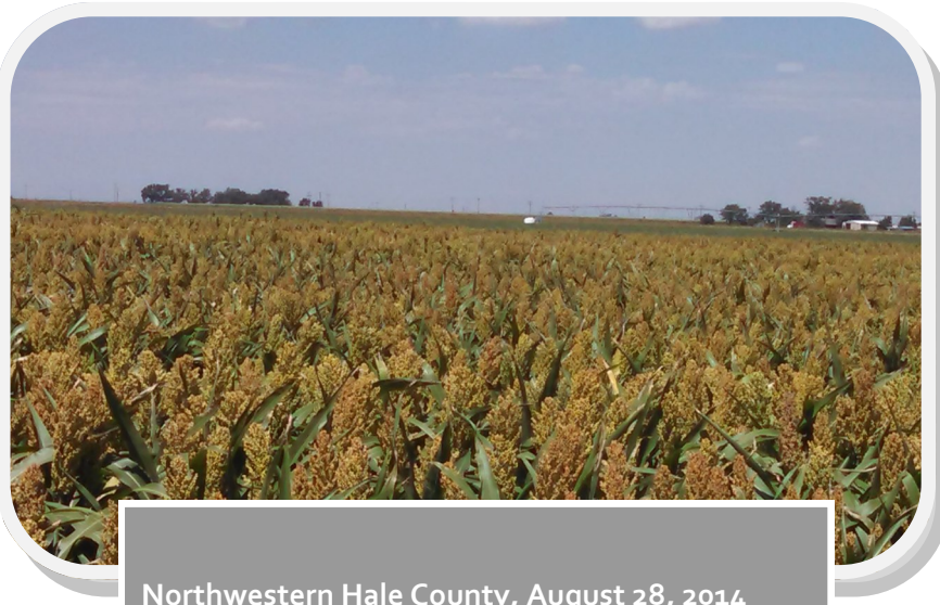
Northwestern Hale County, August 28, 2014

It has been a hot and humid week with scattered, spotty, and fast moving storms skirting or streaking through on an almost daily basis. The nature of the storms makes it very hard to get a handle on how much of the needed moisture fell through the area, but I believe most of us received at least a few tenths and I have some reports of over an inch in localized pockets and strips. Regardless of the amount, no one is claiming they have had enough. All fields benefited from the moisture and all but the very latest and rankest irrigated cotton still need more pretty soon. In the areas that have not seen any since July, the rains gave the desperate dryland sorghum and hay crops a fighting chance if more rain comes soon. I have one report of some fairly heavy hail along the Hale / Floyd County line that came with last night's round of showers. We have a day or two more days with chances of rain in the forecast depending on who you listen to.